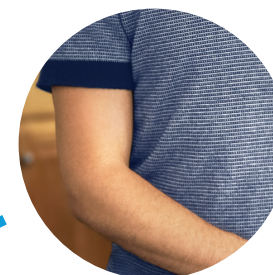
Clothes with access to arms

Some patients like to treat themselves on infusion day. What is something you can do for yourself on the days of your infusions?